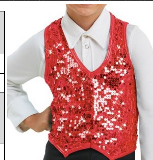
Jazz - includes button up shirt

*No make-up required unless specifically discussed with teacher